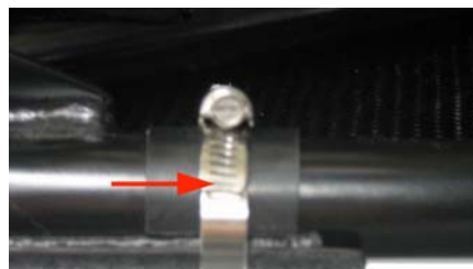
Hose clamp centered in rubber protective strip.

4.) Used supplied hose clamps to secure A-Arm guards to A-Arms. Position hose clamp screws to face the rear of the machine.